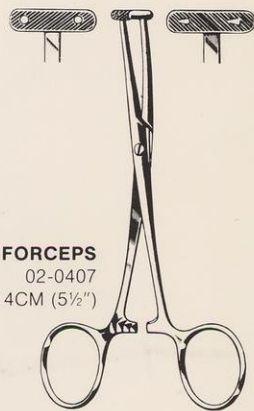
FACIAL FLAP FORCEPS