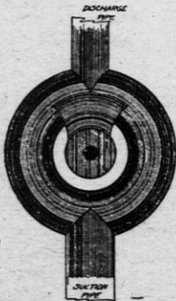
"THE WRONG KIND"

In many factories vats have been placed against the wall or within a few inches of it. This is objectionable because walls become bespattered. The narrow space between the vat and the wall cannot be cleaned easily, and the vat is accessible for cleaning from one side only.