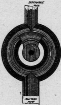
“THE WRONG KIND”

Proper arrangement saves time In many factories vats have been placed against the wall or within a few inches of it. This is objectionable because walls become bespattered. The narrow space between the vat and the wall cannot be cleaned easily and the vat is accessible for cleaning from one side only.