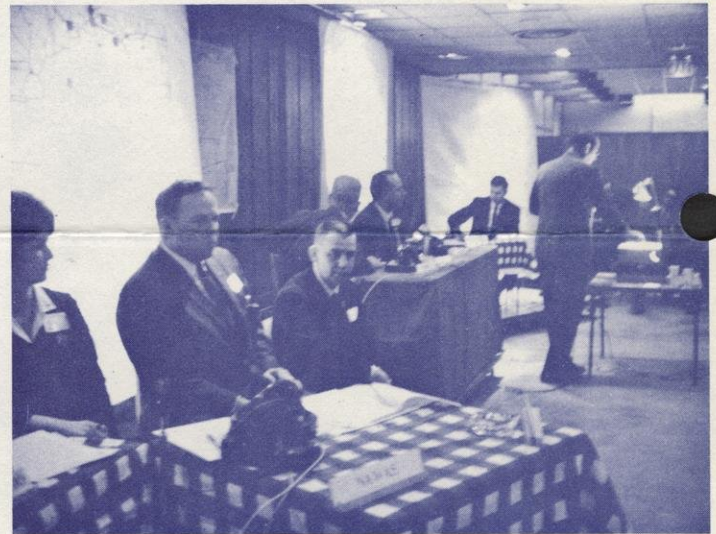
State, federal and local officials prepare for demonstration of tornado watch and warning system.