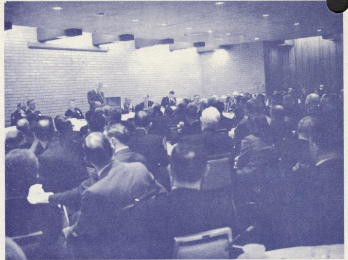
Governor Knowles addresses large conference turnout.