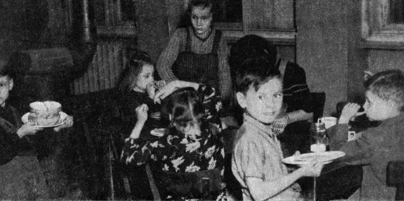
Will the rising generation learn the taste of the fruits of freedom?

groups without interfering with the Army's occupation mission. Wherever possible, recreational facilities retained by the Army are to be shared with local youth groups. The German economy is not to be drawn upon further to supply the Army with recreational equipment. In such cities as Wiesbaden, playing fields have already been released by the Army and are now under the supervision of the Kreis youth committee which arranges their use in such a manner as to serve the greatest possible number of young people. In Heidelberg, Wiesbaden, Munich, Berlin District and elsewhere efforts are now being made to obtain part-time use of additional facilities.