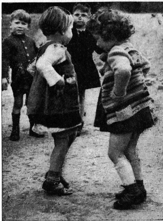
Two future German citizens learn to play.

Military Government assumed no operating responsibility for organized youth activities. Instead, it instituted a voluntary system through which the Germans could express their interest and serve their community. Kreis youth committees were established as the basic instrument for furthering organized young people's activities and for preventing organizations found acceptable from being exploited for Nazi or militaristic purposes. Consider-