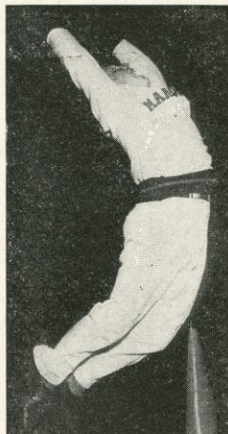
Both sides of the stadium rock with cheers every time the cheerleaders raise their arms. The team on the field is spurred on to victory by the outward display of enthusiasm evidenced in cheers. To the right is a view of the west stand of the stadium in all its white solemnity. In this mammoth arena the Blue and Gold athletes give battle to the enemy.