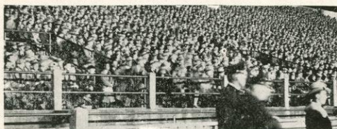
Along the sidelines and immediately below the thousands in the stands are prominent Milwaukeeans watching Marquette games from special boxes. The introduction of night football finds Milwaukee's elite forsaking the opera for the gridiron.

Every minute of every hour of the day students pass this intersection going to and from classes. Campus walks are yet a dream to Marquettians, but they seem to enjoy the convivial group on the Avenue. This is but one of the scenes around the Marquette buildings, where students gather.