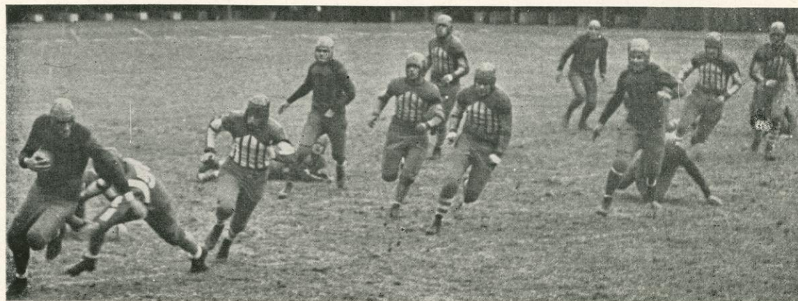
Like eleven great steam rollers, the Marquette Golden Avalanche has side-stepped everything offered by foes this season, much in the manner you see this individual cog sneaking around left end. Allowing two victories from last season, the Avalanche has ten