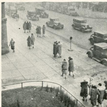
Every minute of every hour of the day students pass this intersection going to and from classes. Campus walks are yet a dream to Marquettians, but they seem to enjoy the convivial group on the Avenue. This is but one of the scenes around the Marquette buildings, where students gather.