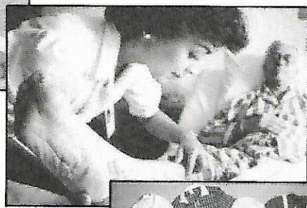
▲ NURSING PROCESS