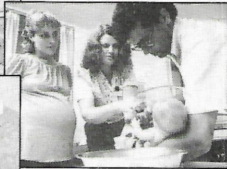
PATIENT TEACHING ▼