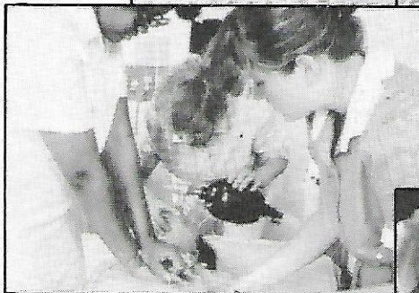
▲ CARDIAC ARREST