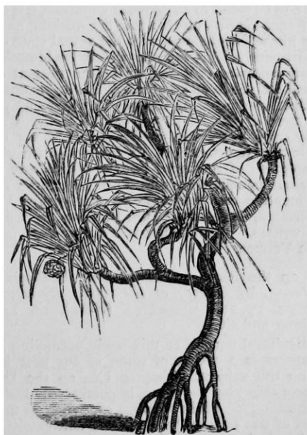
SCREW PINE ( Pandanus ), showing aerial adventitious roots

botanical text-books, as worthy of their imitation. These are qualities which improve the mind of the pupil more