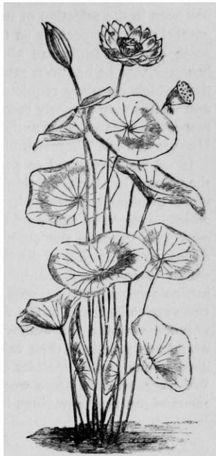
SACRED LOTUS ( Nelumbium speciosum ), about one-tenth to one-fifteenth natural size

In conclusion, we would recommend a close study of the precision of our author's descriptions, and the clearness and terseness of his diction, to the writers of