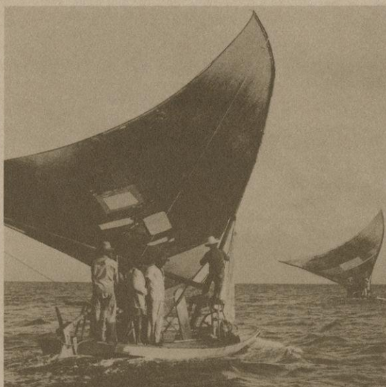
"Brazil in a Nutshell"