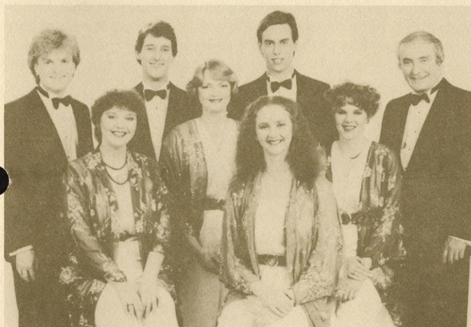
The New Swingle Singers

The New Swingle Singers , hailed as masters of classical scat or "mouth music," will perform November 3, offering music ranging from Bach and Mozart to Cole Porter, Scott Joplin and the Beatles. The ensemble's remarkable sound,