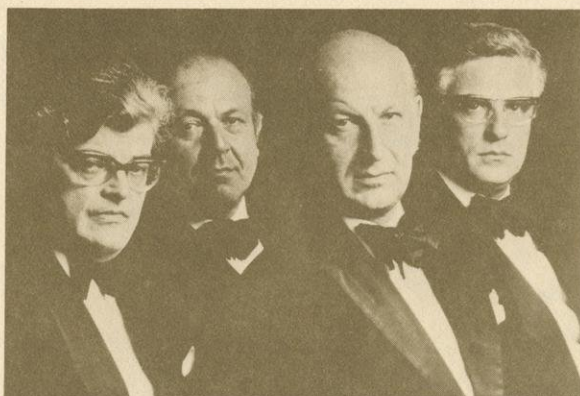
The Amadeus Quartet