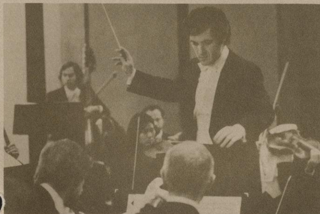
Saint Paul Chamber Orchestra conducted by Pinchas Zukerman

Tickets for the September 21 concert are $15.00, $13.00 and $12.00. Single tickets may be limited due to the series sale; priority will be given to series subscribers. Mail orders for single tickets will be accepted now, but orders will not be filled until August 29. Any remaining tickets will go on open sale September 6.