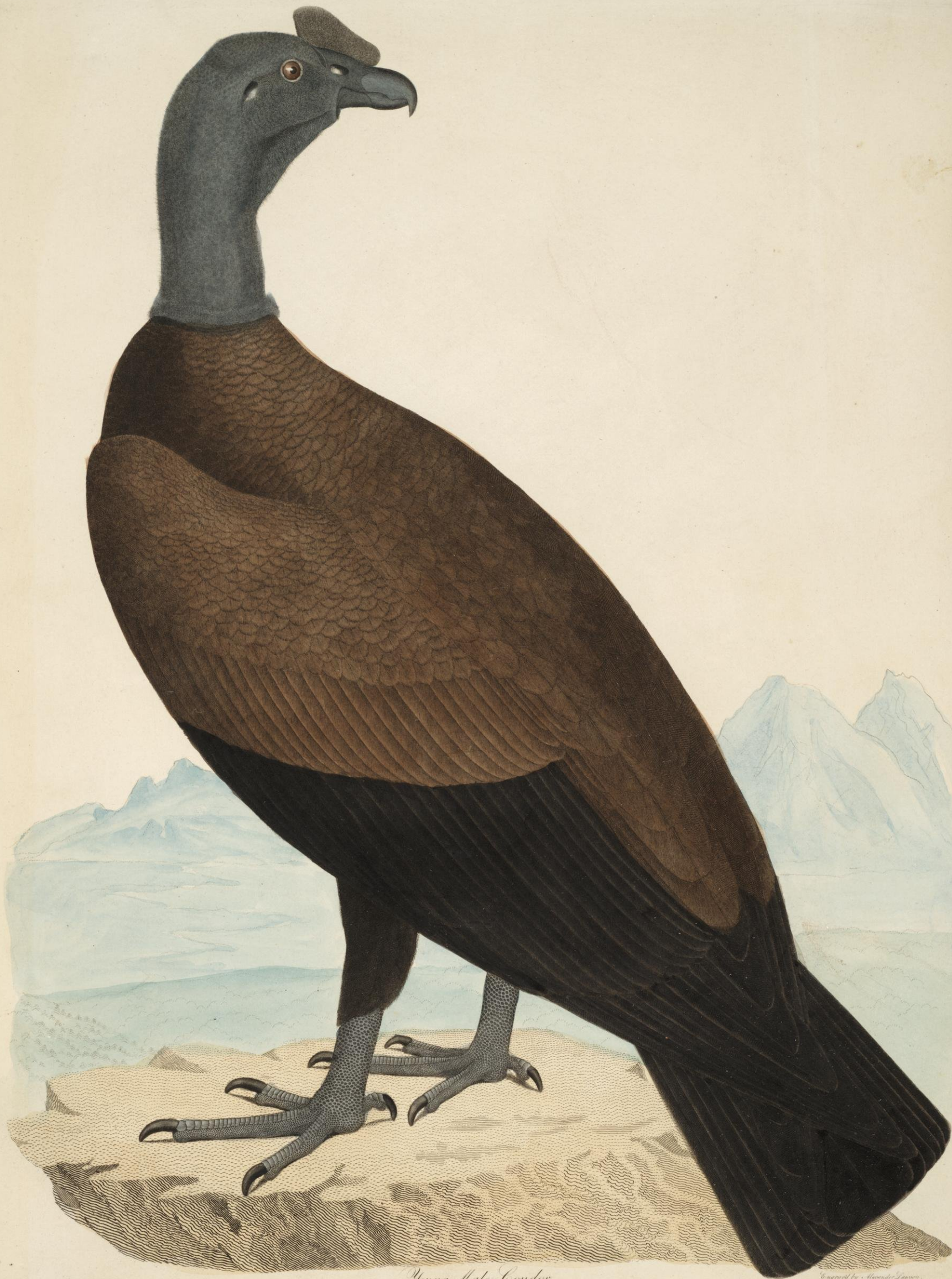
Young Male Condor. Cathartes Gryphus.