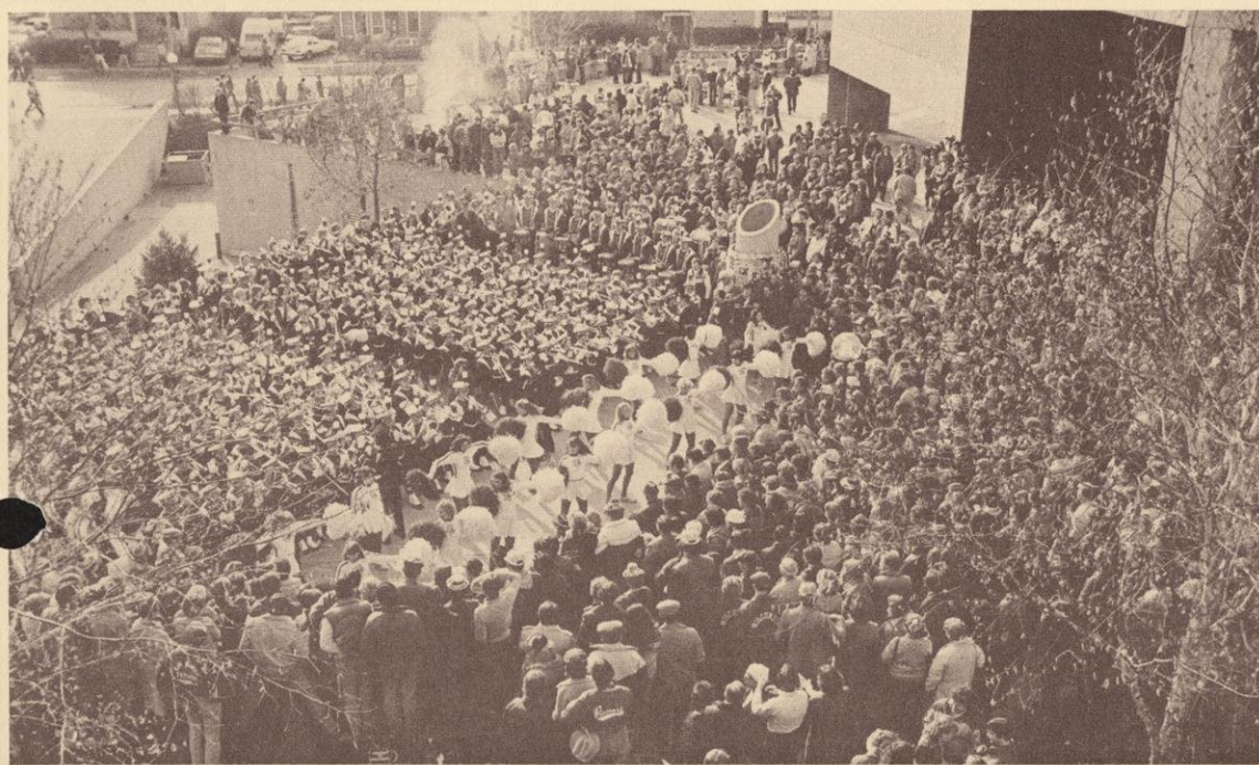
Badger Bash, Union South