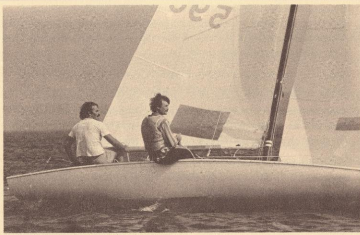
The Sailing Club in action

*Hoofers Sailing Club is hosting the U.S. Laser Nationals, attracting top singlehanded sailors from across North America. The launching site will be at Marshall Park, west end of Lake Mendota, with 100 boats expected. The winner qualifies for the Laser World Championship next summer.