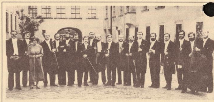
The Polish Chamber Orchestra

David Gordon/Pick Up Company , N.Y.C. dance group - Mon., Oct. 26