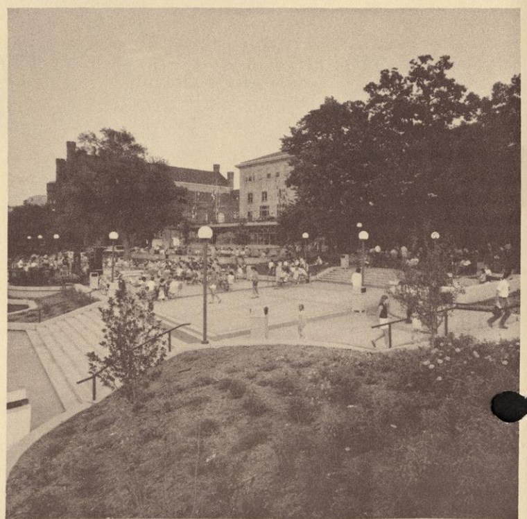
The newly remodeled Memorial Union Terrace

Remember — Union members, their friends and relatives receive reduced rates on Union guestrooms. But the best part of the deal is that we clean up after you or your guests have gone home!