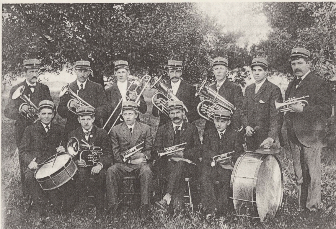
St. Peter's Band