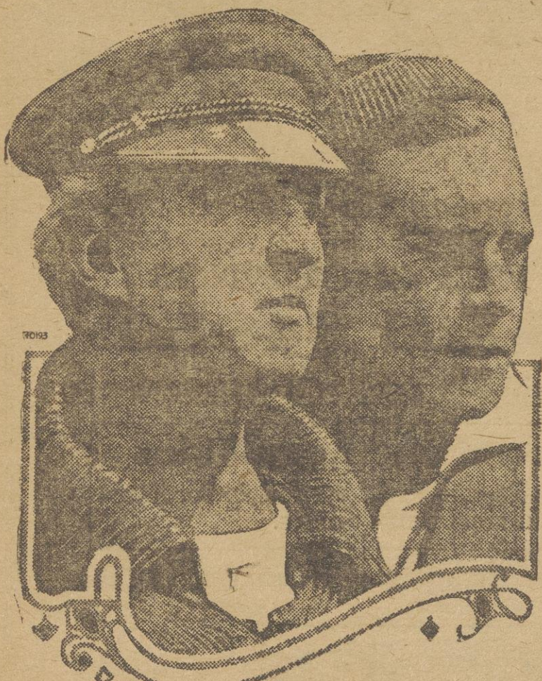
HOBART BOSWORTH and LLOYD HUGHES in a scene from the THOMAS H. INCE Production "BELOW THE SURFACE" A PARAMOUNT ARTCRAFT PICTURE

ALSO COMEDY CARTOON AND PARAMOUNT MAGAZINE