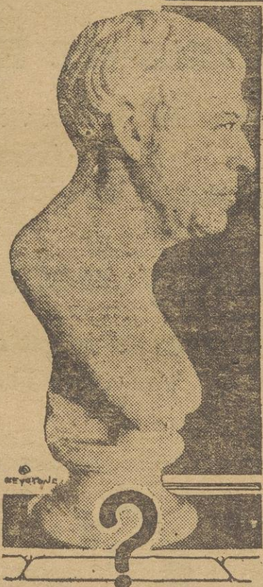
The uncatalogued bust of President Zachary Taylor.

Among the many famous statues and works of art in the capitol building at Washington, D. C., is a marble bust of President Zachary Taylor. It is uncatalogued and of unknown origin. There seems to be no record of how the statue came to be placed in the capitol.