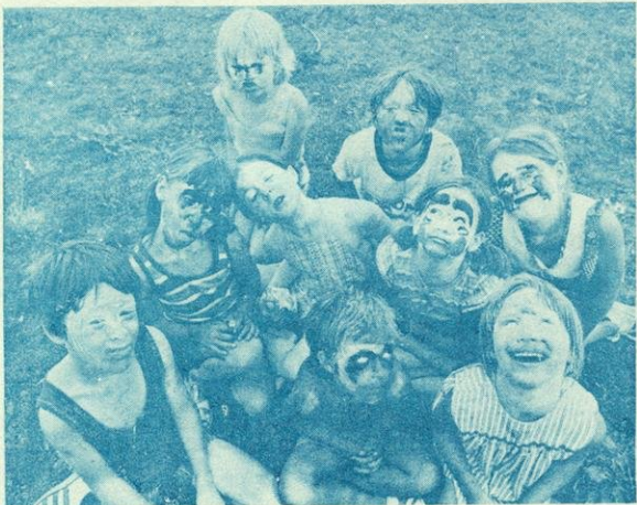
Children's craftshop participants are shown here on a day this summer when they all learned clown make-up techniques. It was a success!

A "Corner Store" combining gift items, greeting cards, school supplies and stationery has opened at Union South in the lobby area. The store also takes orders for the copy service located in the Craftshop. The store is open from 8:30 a.m. to 8 p.m. Monday through Friday and from 9 a.m. to 1 p.m. and 3 to 5 p.m. on football Saturdays.