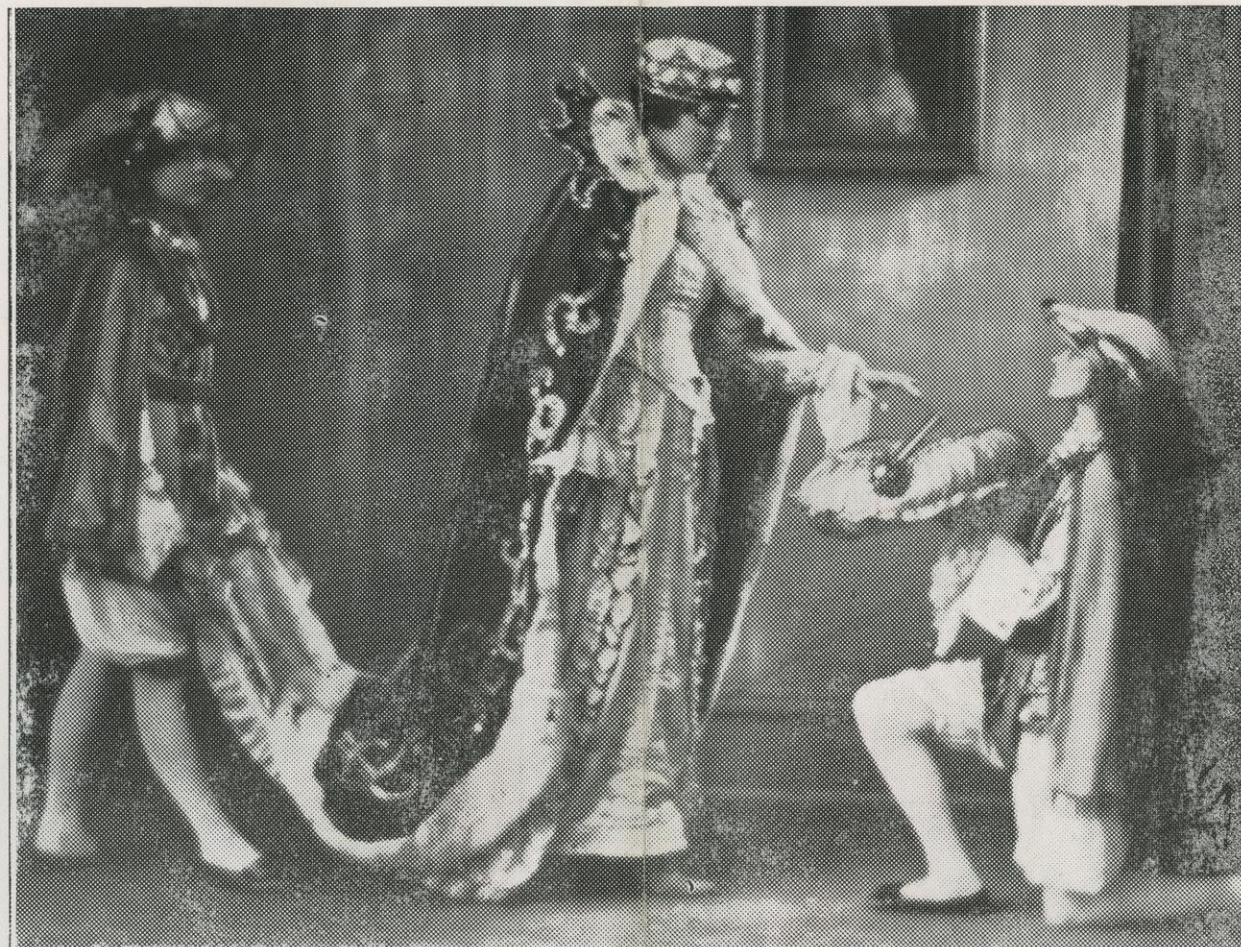
Festival Queen Receives Her Sceptre.

Scores of men and dozens of teams would be required to do the same amount of work in the same length of time. It is a great saving of both money and time to be able to employ the dredge. This is possible because of the size of the undertaking. It's one of the advantages enjoyed by a development so large. And the saving means so much more money saved for the Lake Forest investors and citizens.