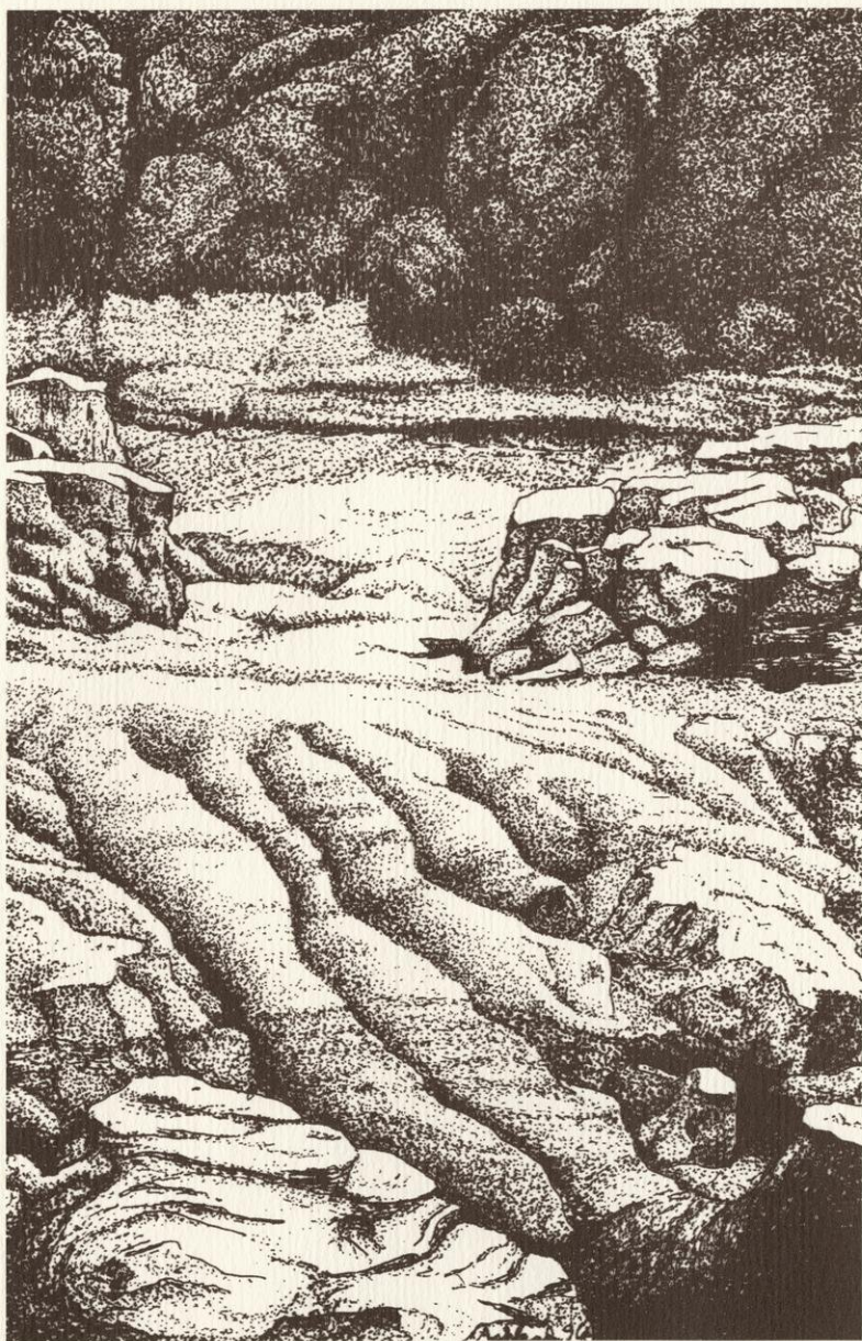
BLM lands in New Mexico