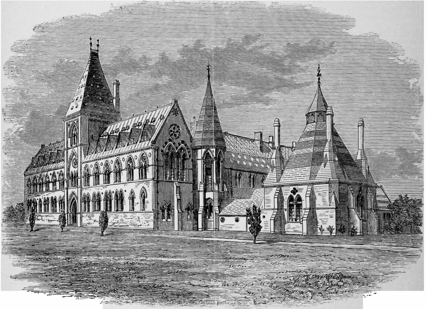
THE MUSEUM AT OXFORD

Taking the rewards and honours first, we would notice