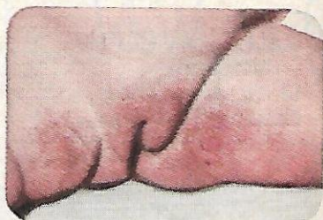
Before application of A and D Ointment—Typical diaper rash with excoriation of skin.