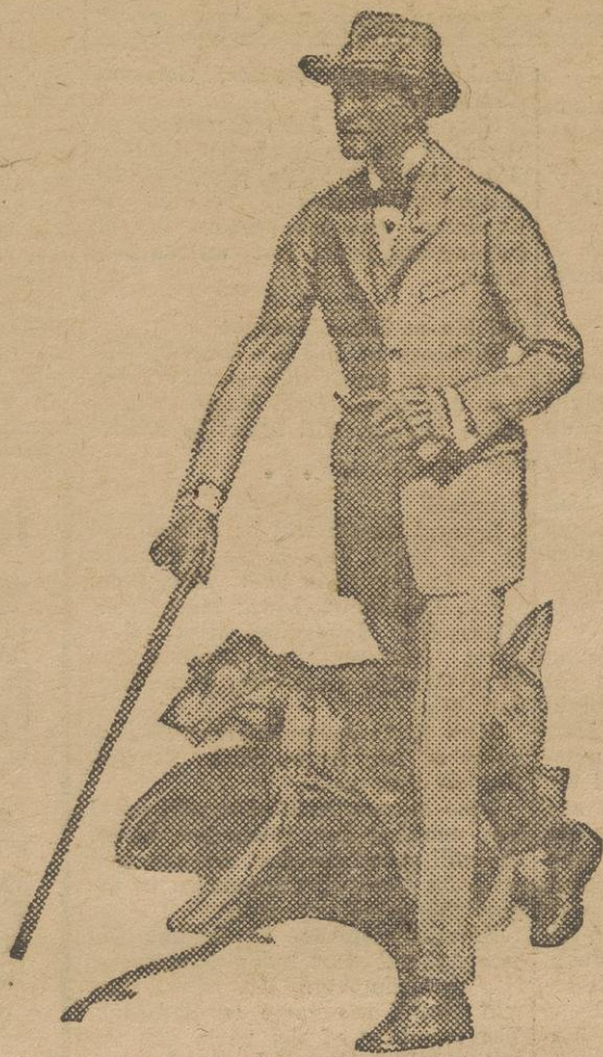
Copyright 1921 Hart Schaffner & Marx