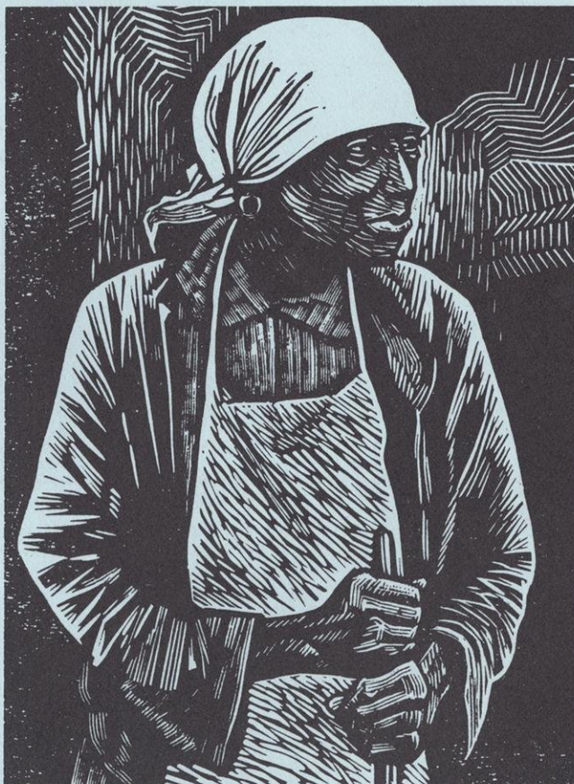
"The Survivor," linocut by Elizabeth Catlett, portraying Sojourner Truth.