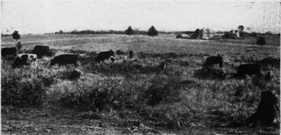
The Greatest Hay, Clover, and Dairy Country in the World

The county seat of Marathon County is Wausau, a beautiful town of about twenty thousand. Mosinee is a beautiful town located close to the colony, and a little south of Wausau. Mosinee has beautiful residences, good streets, and factories. It is a rapidly growing town, settling up quickly just like the rich lands around it, and it is expected to become a large town. Mosinee is located on the main line of the Chicago, Milwaukee, and St. Paul railroad. This line