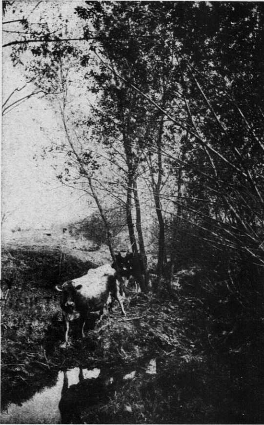
Dairying Makes Marathon County Prosperous

Dairying in this fine clover and timothy country makes Marathon County very prosperous. Our Land is going up in value very rapidly. You can come to Marathon County and get a productive and valuable dairy farm for yourself.