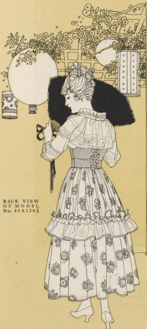
BACK VIEW OF MODEL No. 43A120½