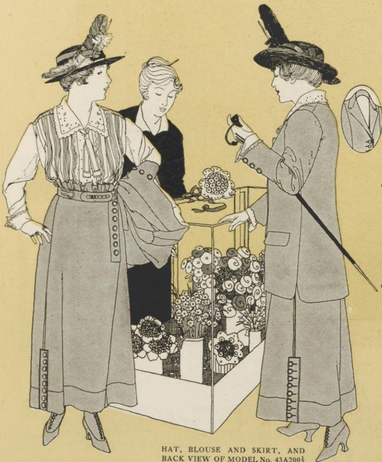
HAT, BLOUSE AND SKIRT, AND BACK VIEW OF MODEL No. 43A200½