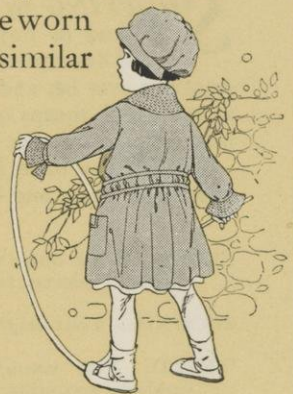
BACK VIEW OF MODEL No. 43A145

F OR my very littlest friend I have planned a dear little cover-up coat. It is quite unpretentious, as I believe children's clothes should always be. The slight fullness is belted in at the waist with two narrow straps with buckles, instead of the usual wide belt. Another buckled strap is fastened about the collar, which may be worn turned up or lying flat, and a similar strap is fastened about the cuff of each sleeve. Big patch pockets on either side are very swagger for the little maid. This design, with the little hat to match, may be worn in autumn as well as spring.