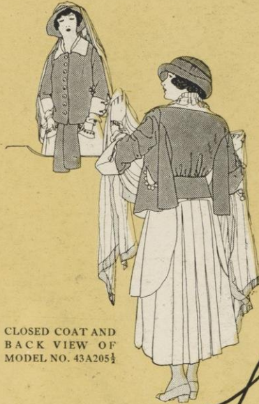
CLOSED COAT AND BACK VIEW OF MODEL NO. 43A205½

The smart little round hat "Billy" matches the coat in ma-