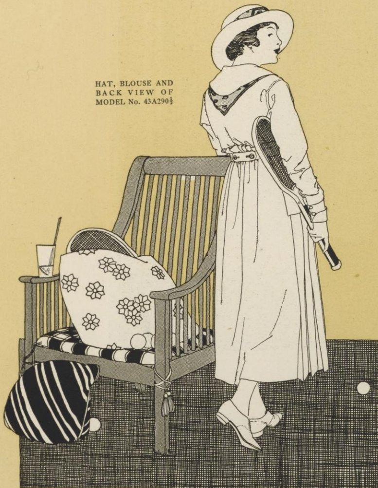
HAT, BLOUSE AND BACK VIEW OF MODEL No. 43A290½