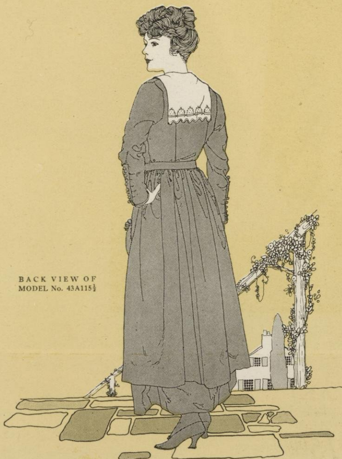
BACK VIEW OF MODEL No. 43A115½