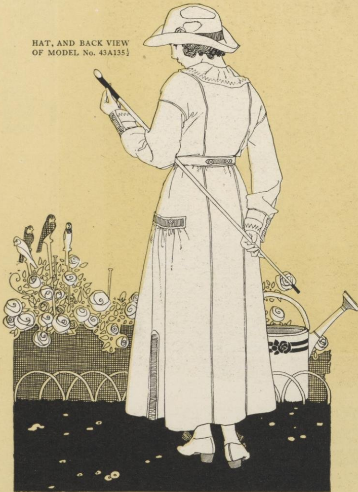
HAT, AND BACK VIEW OF MODEL No. 43A135½