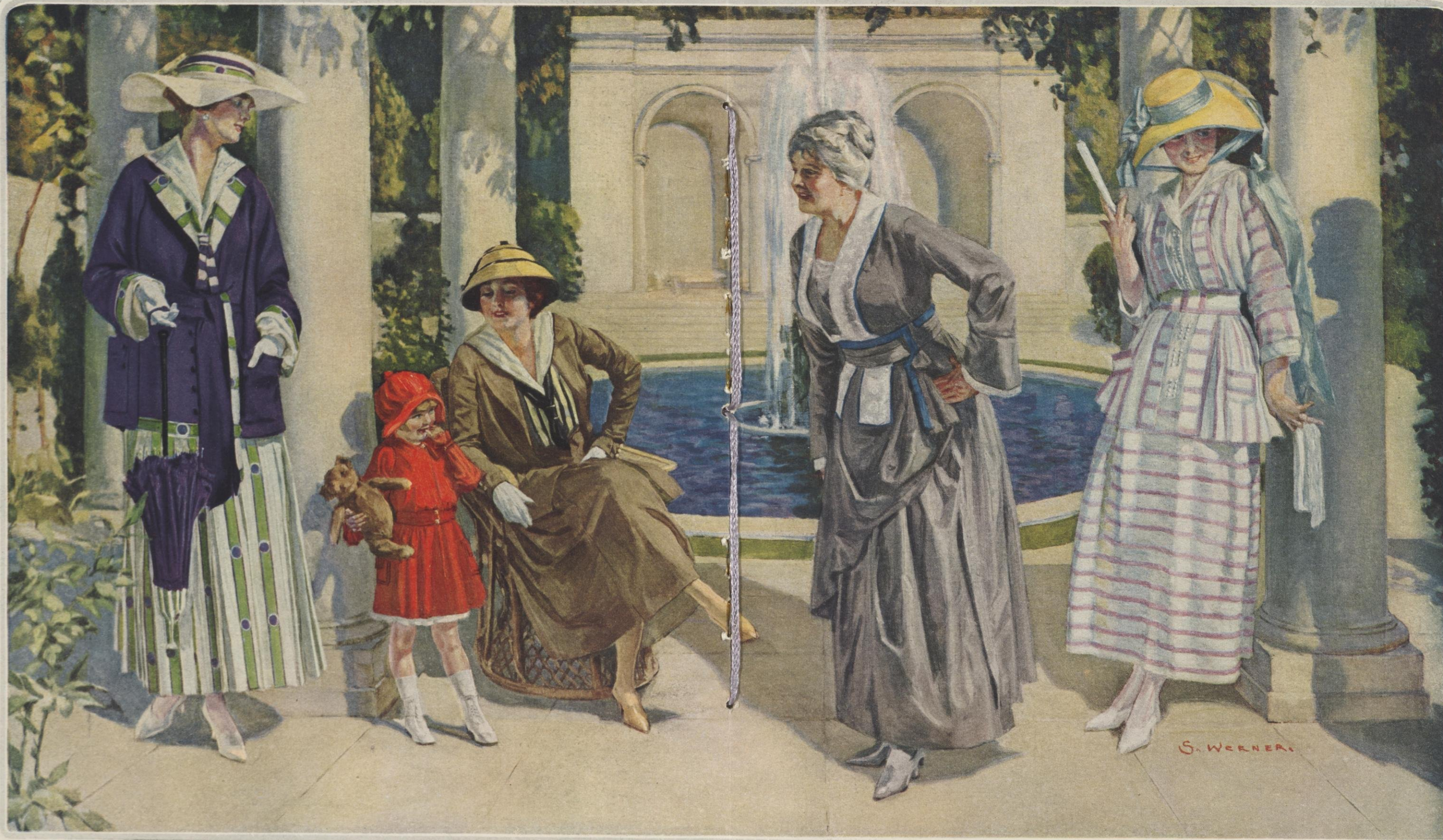
"TOWN and COUNTRY," Model No. 43A215½ (Suit only) PRICE $37.50 "THE LITTLEST ONE," Model No. 43A238½ (Coat and hat) PRICE $12.50 "THE MARGATE," Model No. 43A210½ (Suit only) PRICE $35.00 "MISTRESS PRUE," Model No. 43A140½ (Dress) PRICE $37.50 "IRRESISTIBLE," Model No. 43A145½ (Dress) PRICE $12.50

For other views and descriptions of these models see pages 60, 61, 62 and 63