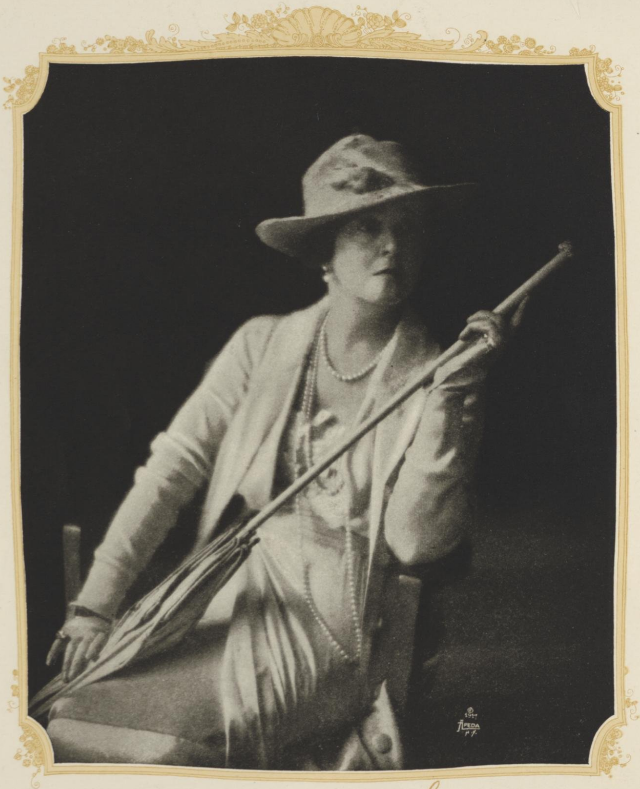
Lady Duff Gordon