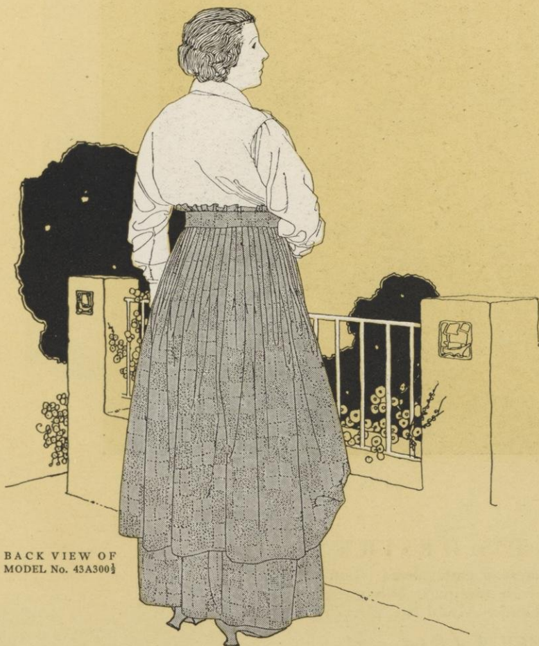
BACK VIEW OF MODEL No. 43A300½