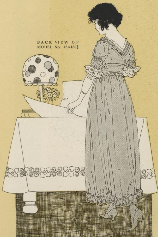
BACK VIEW OF MODEL No. 43A160 \frac{1}{2}