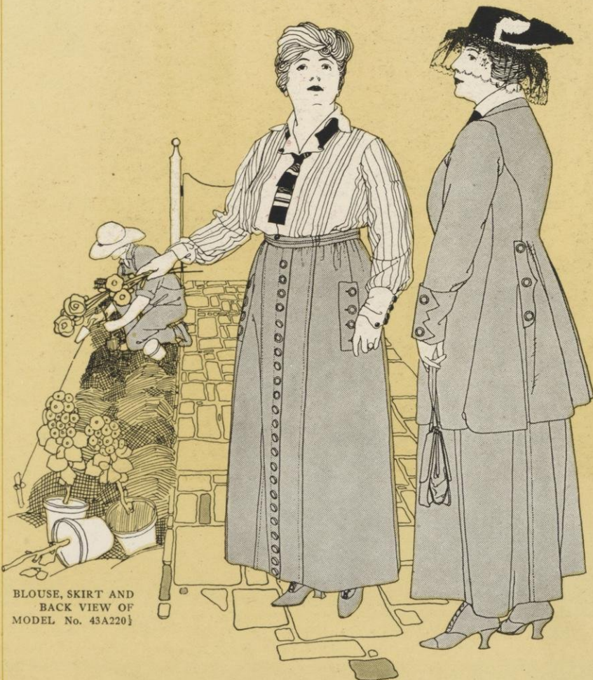
BLOUSE, SKIRT AND BACK VIEW OF MODEL No. 43A220½

It will take from twelve to fifteen days after your order is received, to complete any of the models, as they are made to measure. Delivery charges prepaid by us. See page 64 for measuring instructions, and how to send money.