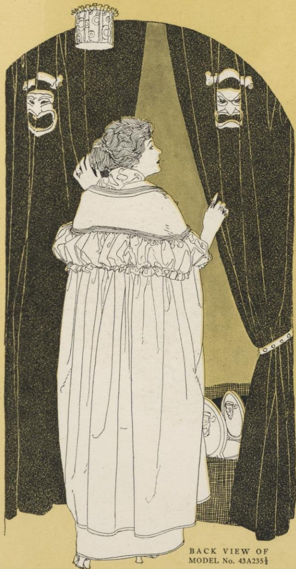
BACK VIEW OF MODEL No. 43A235½

I SHOULD like you to feel that to own this beautiful, comfortable wrap would not be, in any sense, an extravagance. In this changeable climate of ours a garment of this kind is a necessary part of every woman's wardrobe. It protects your clothes and your health, and gives you real satisfaction to know that your beautiful gown is covered by a wrap that quite matches it in beauty. Clothed in "Contentment"—a pretty, fanciful thought which I should like you to remember when you wear this cloak of mine.