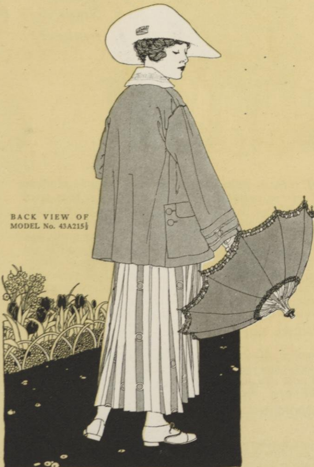
BACK VIEW OF MODEL No. 43A215½

For illustration of these models in colors, see pages 32 and 33.