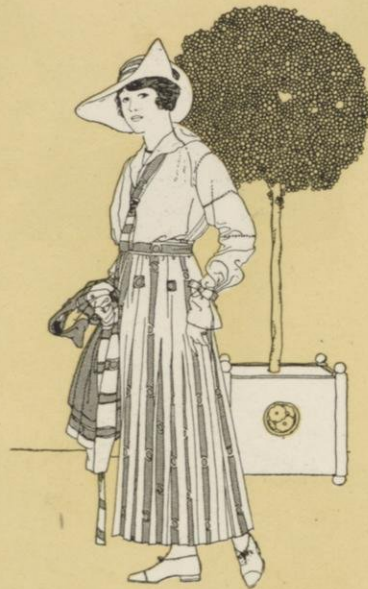
BLOUSE AND SKIRT OF MODEL No. 43A215½

O UT for a stroll through shady country paths, off for the golf or tennis tournament, on the avenue exploring the city's mid-summer attractions, anywhere this stunning sports suit appears it is certain to cause a flutter of excitement. I know what happened when it was being made up in my studio, and when its picture was being taken somewhere else, and I know what will happen when it appears on you, wherever you choose to wear it. The straight sports coat may be either royal purple, glowing cerise, or natural tan tussah, with full plaited skirt of striped