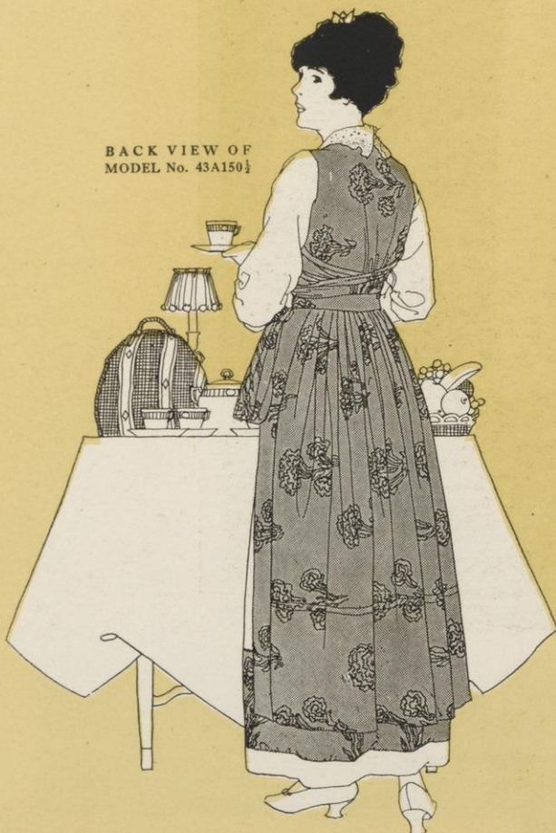
BACK VIEW OF MODEL No. 43A150½