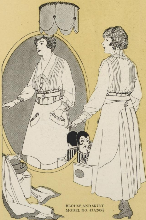
BLOUSE AND SKIRT MODEL NO. 43A205½