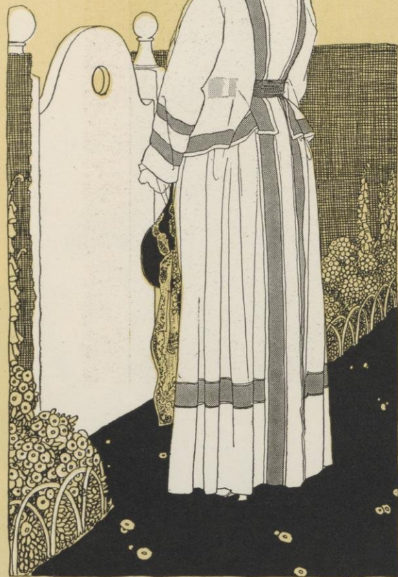
BACK VIEW OF MODEL No. 43A180½