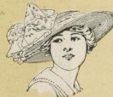
FRONT VIEW OF MODEL No. 43A340½