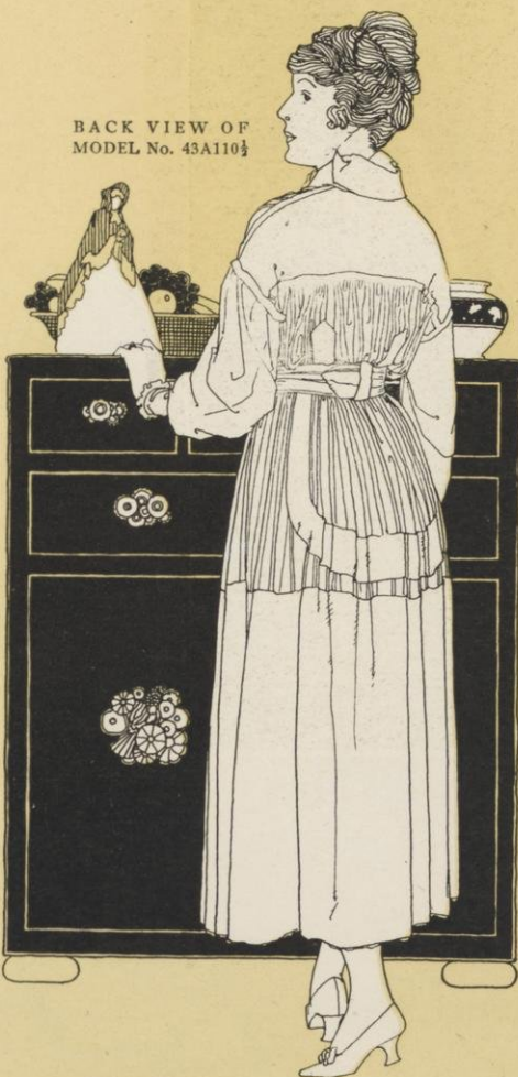
BACK VIEW OF MODEL No. 43A110½