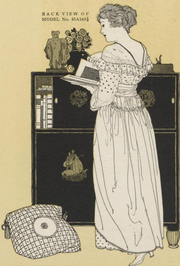
BACK VIEW OF MODEL No. 43A165½