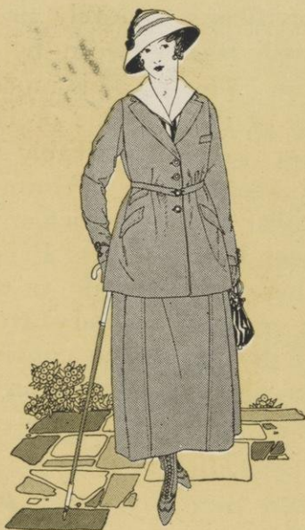
FRONT VIEW OF MODEL No. 43A210½

T HE always attractive outdoor type of English woman was my thought for "The Margate." She is the woman who loves to be in the open, who stands on her own well-shod feet, is a good comrade and an all-around companion. Perhaps, too, I had a wee bit of a thought for the soldier boys while I was at work on this, for it is a true khaki color and almost inspired me to wish for brass buttons. The skirt of the coat has a comfortable fullness held in by a swagger little belt. The collar is severely mannish, and the luxury of four real pockets makes one feel quite a mannish independence. Two novel side panels give sufficient fullness to the skirt. The blouse, "Louise," is my great delight.