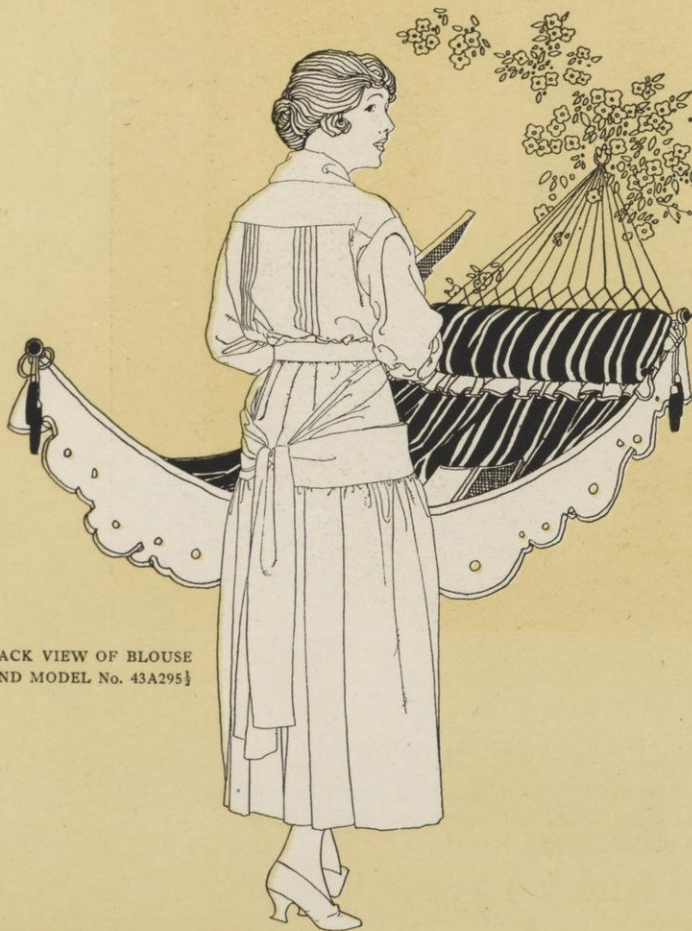
BACK VIEW OF BLOUSE AND MODEL No. 43A295½