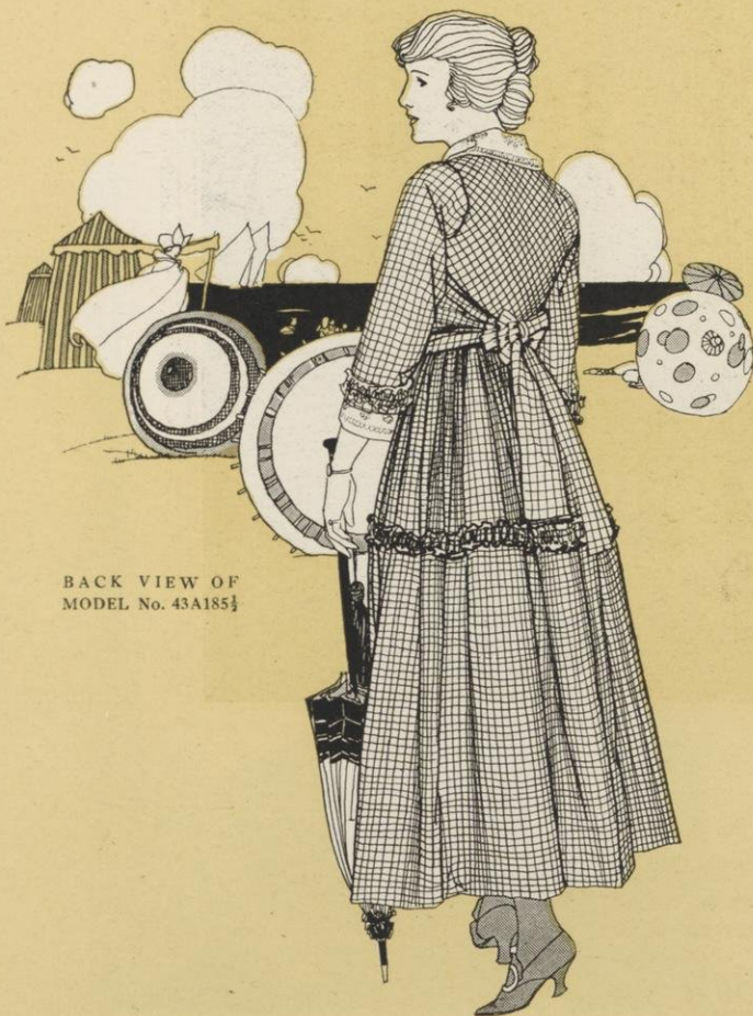
BACK VIEW OF MODEL No. 43A185½