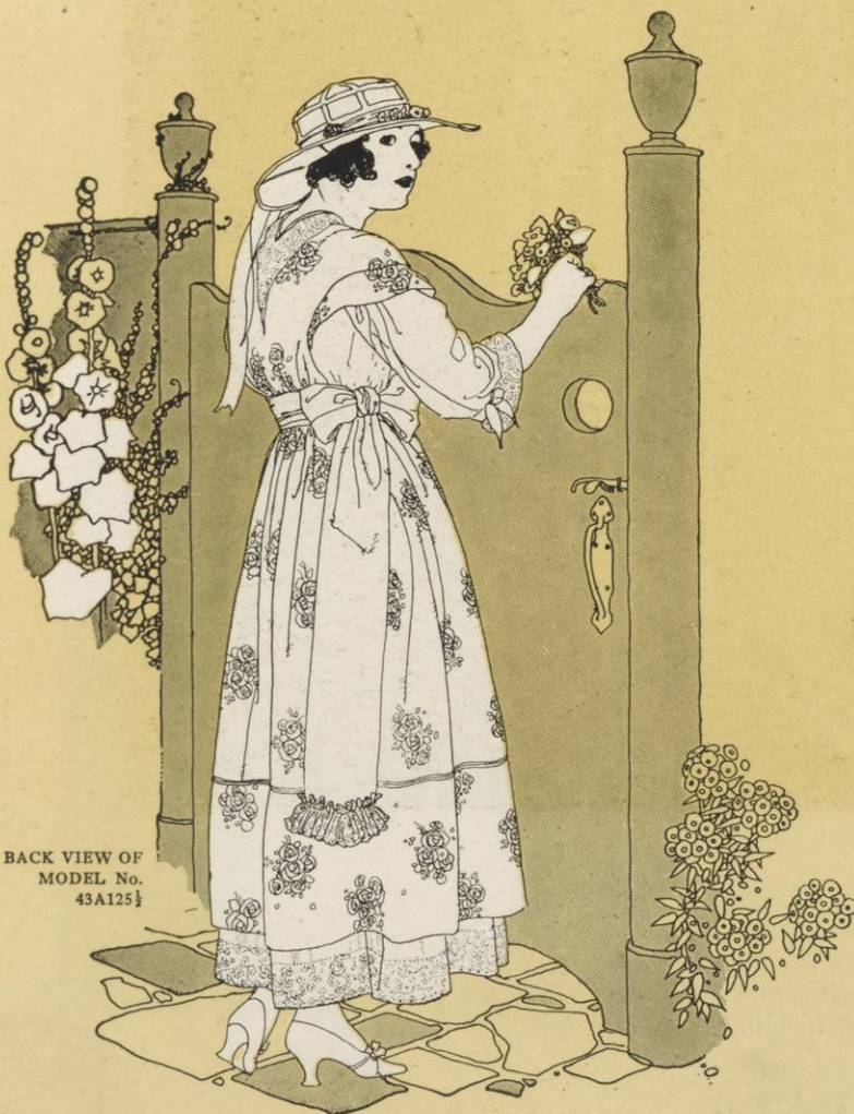
BACK VIEW OF MODEL No. 43A125½