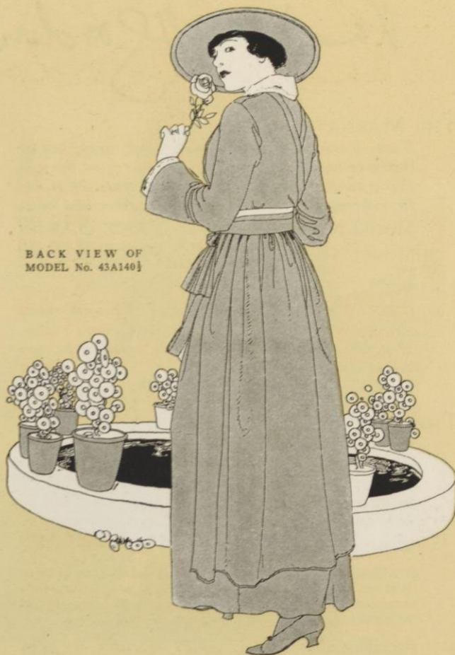
BACK VIEW OF MODEL No. 43A140½