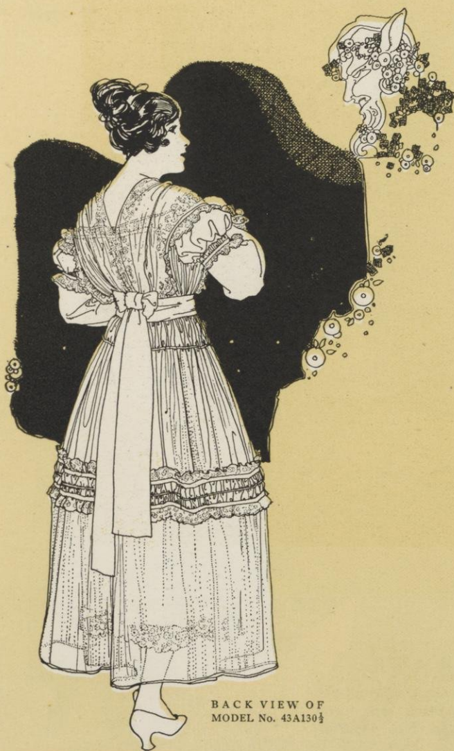
BACK VIEW OF MODEL No. 43A130½