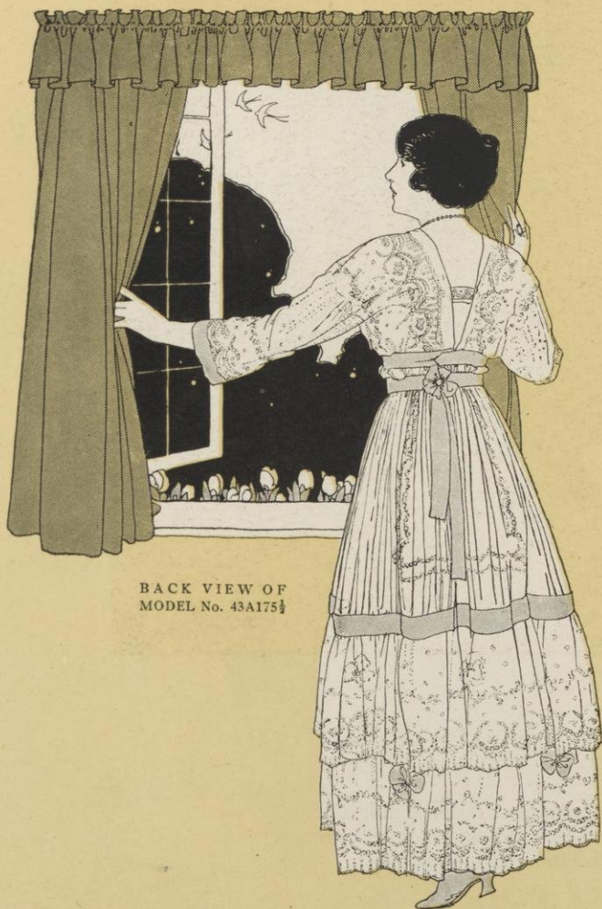
BACK VIEW OF MODEL No. 43A175½