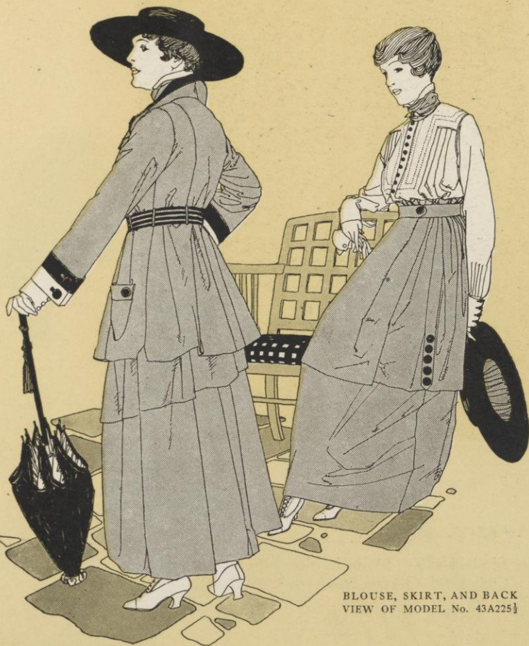
BLOUSE, SKIRT, AND BACK VIEW OF MODEL No. 43A225½