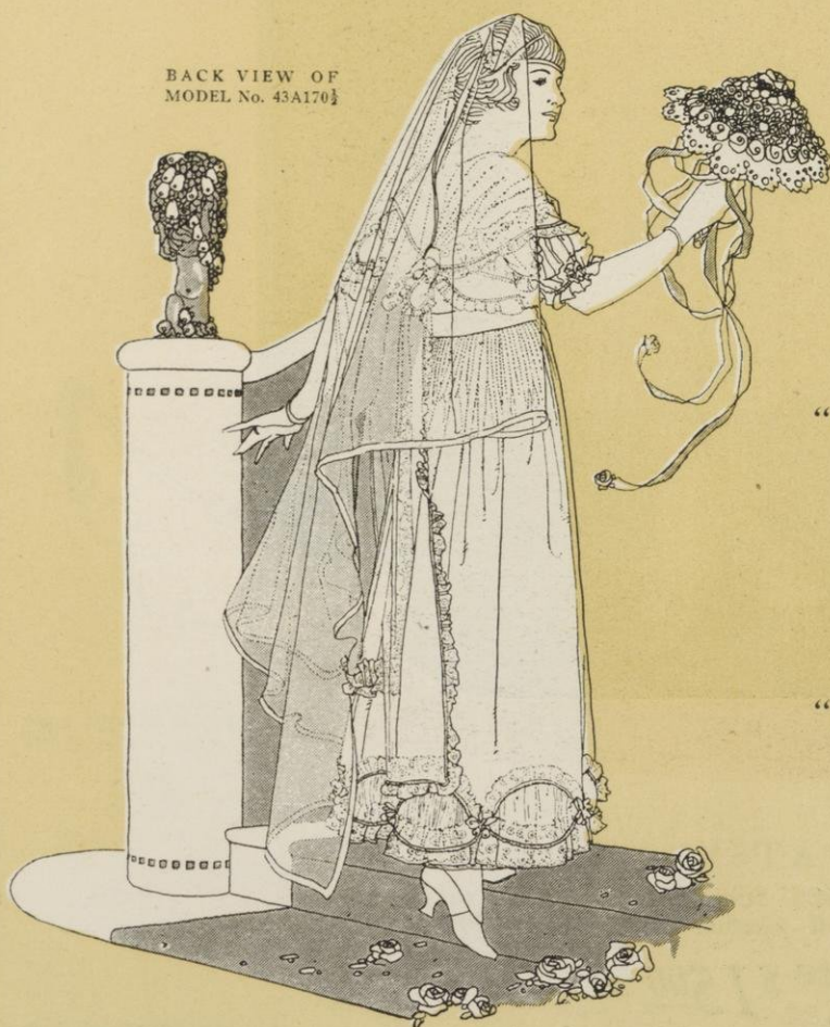
BACK VIEW OF MODEL No. 43A170½

Whether you plan to have a June-time or an Easter wedding, "On the Threshold" and "Love-in-a-Mist" will make you a very lovely bride, a "pearl among women" to the happy bridegroom. Afterward, by simply removing the knots of orange blossoms, this ivory white satin gown will be beautiful for evening wear on many occasions. Bless you, my dear, and may the new life bring you all you have hoped for.