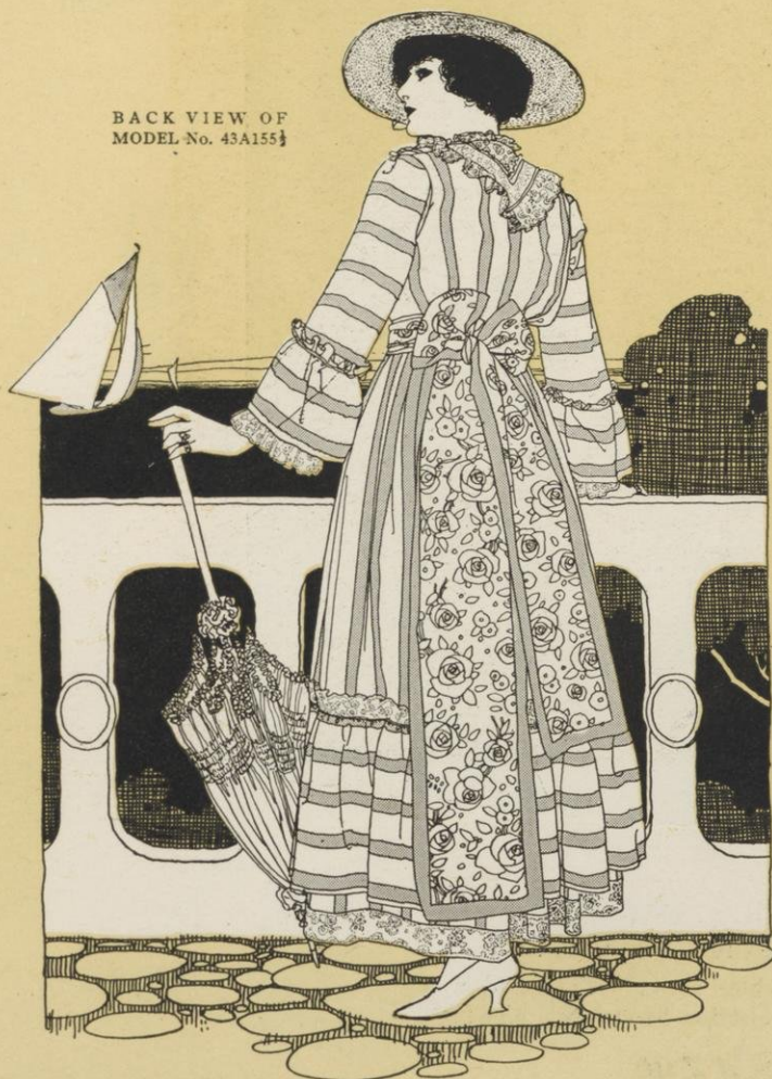
BACK VIEW OF MODEL No. 43A155½