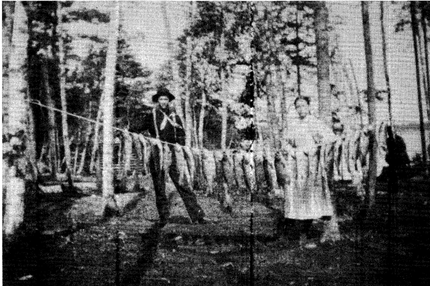
Part of the harvest of 100 "black bass" (all or at least most were smallmouth bass) taken from Pallette Lake by a guide and his client on 9 July 1896.

The Pallette Lake sport fishery has been monitored through a compulsory permit-type creel census since 1946 with complete records from 1958 to date. This long-term data base presented an opportunity to profile the sport fishery for smallmouth bass ( Micropterus dolomieu ), the principal game fish in the lake, and to estimate population size. Information contained in this previously unpublished data set should contribute to