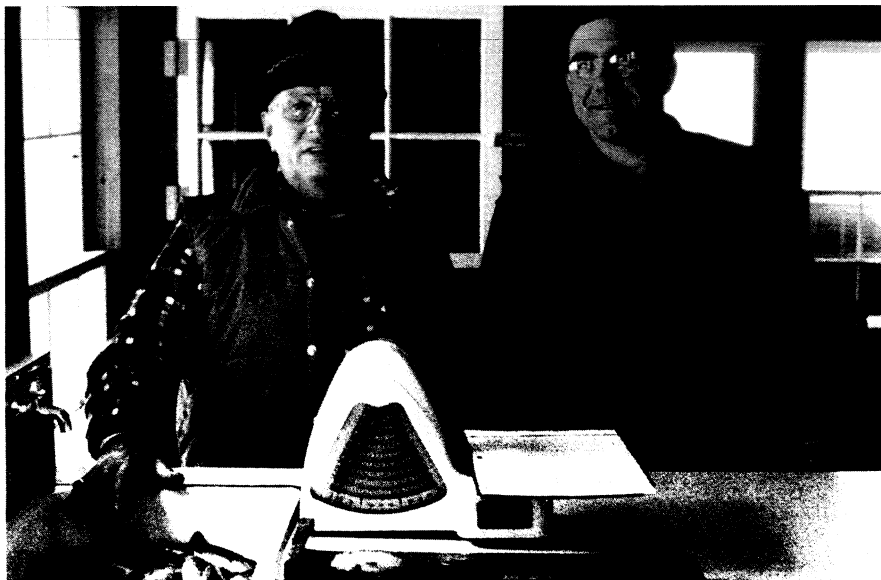
Monitoring of harvest by anglers fishing Pallette Lake has occurred since 1946. Here 2 anglers submit their catch for inspection by clerks at Escanaba Station.