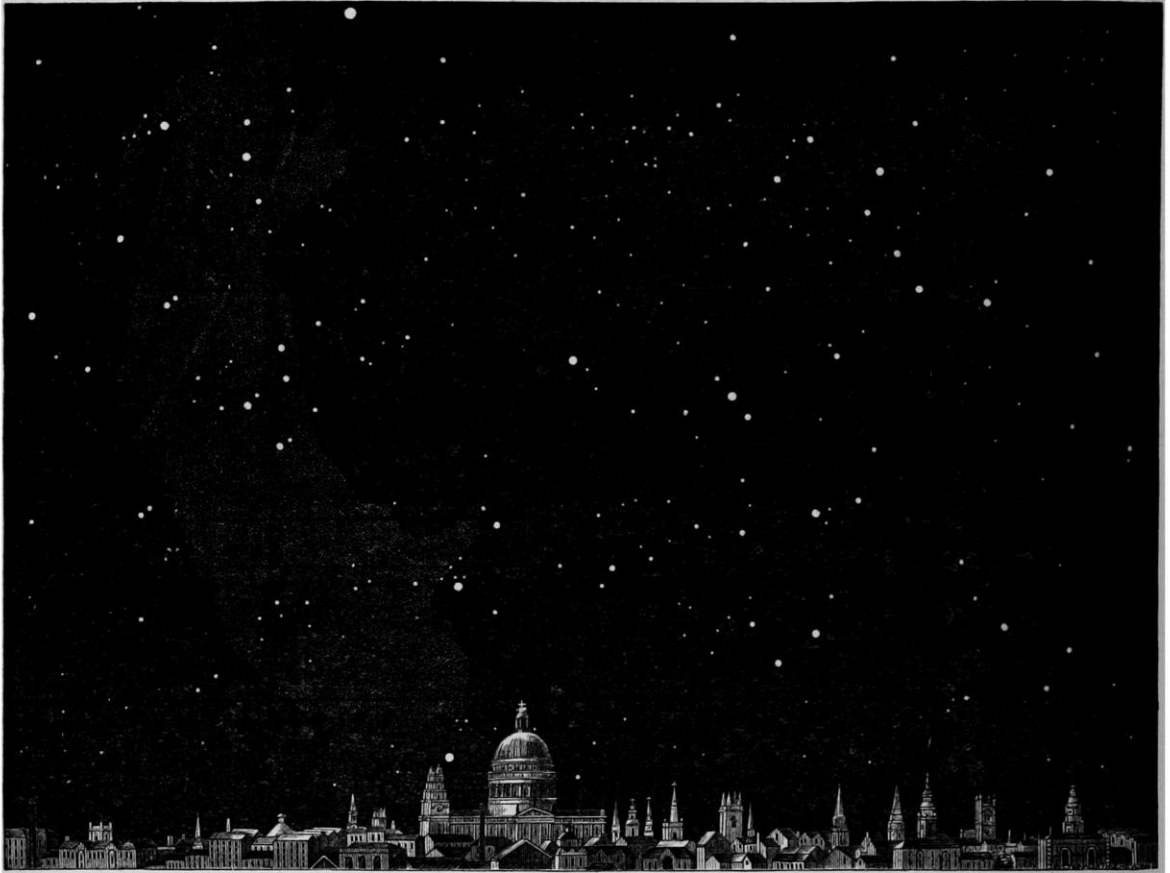
NORTHERN HEAVENS AS SEEN FROM LONDON JANUARY 15 (MIDNIGHT)

Besides the star-maps and key-maps, specimens of which we give, there are excellent telescopic views of the star-cluster in Perseus, the moon, comets, &c., and drawings of Sir