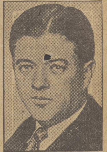
Robert La Follette

"While Sen. La Follette was governor of Wisconsin, Sen. Lenroot was one of his associates in the work of construc-