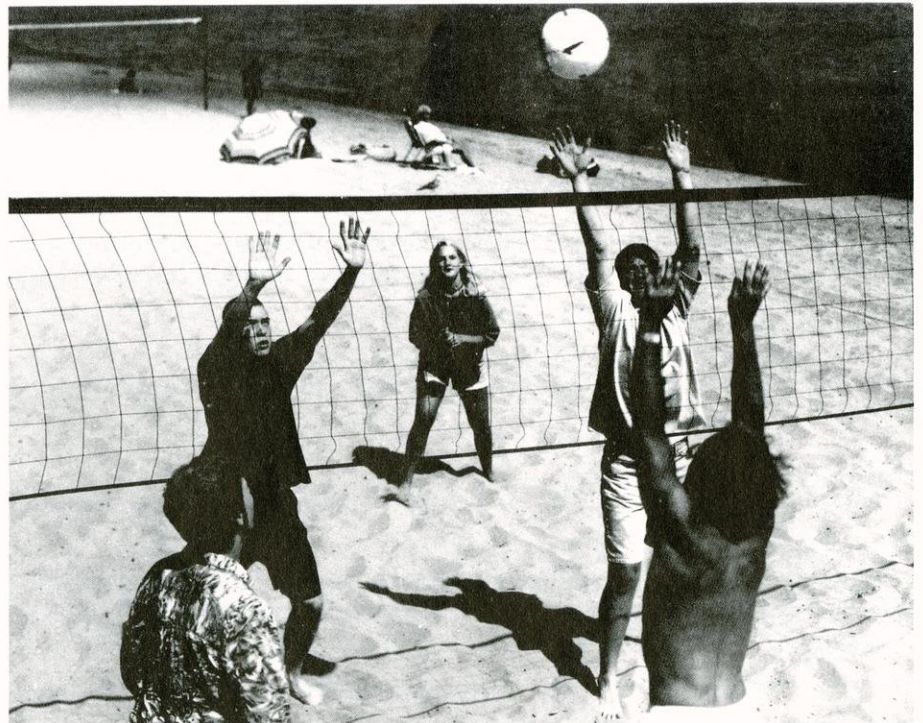
Today, Carron Net Company makes a variety of standard recreational volleyball nets for both indoor and outdoor use, as shown in this photo from the company's sales catalog. It also produces made-to-order sports nets for tennis, basketball, baseball, golf, soccer, football, climbing, track and field, and archery.