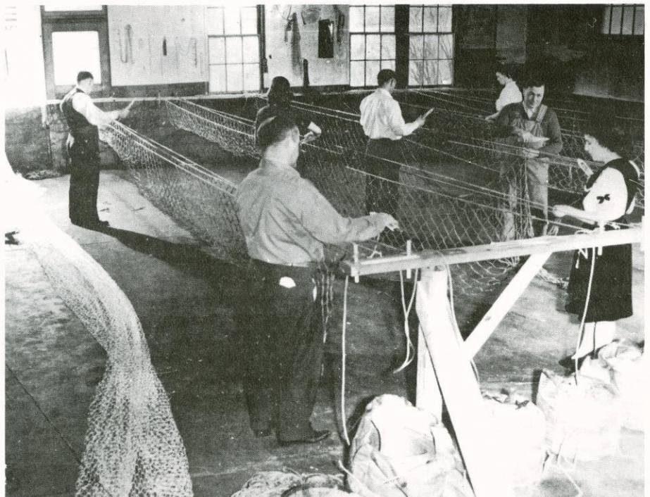
Carron Net Company workers making nets. Photo appeared in The Milwaukee Journal on February 27, 1944. The caption read "A typical factory scene — the equipment is simple but the workers must be skillful."