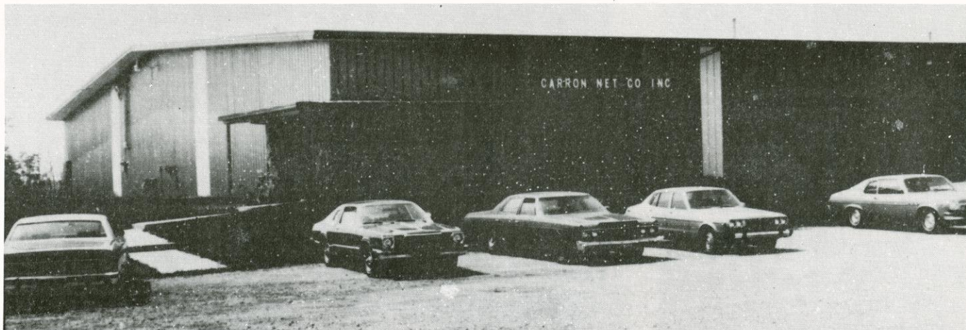
The Carron Net Company built a second plant facility in 1976 and 1977 so large nets could be made indoors. Prior to that, this work was done outdoors and was governed by weather conditions. The large space indoors allowed the company to increase production and provided more room for twisting machinery to manufacture cordage. The plant is located at 2200-27th Street on six acres of land near the West Twin River in Two Rivers. Photo appeared with an article about the company in the Herald-Times-Reporter, July 22, 1979.

As the 1970's approached the business kept expanding and growing. Tennis became very popular and this period is referred to as the tennis boom. Employment doubled from about 30 to 60 employees. During these years the Company began exporting some of its products overseas to the Caribbean area, Venezuela, Mexico, Canada, Germany and Saudi Arabia.