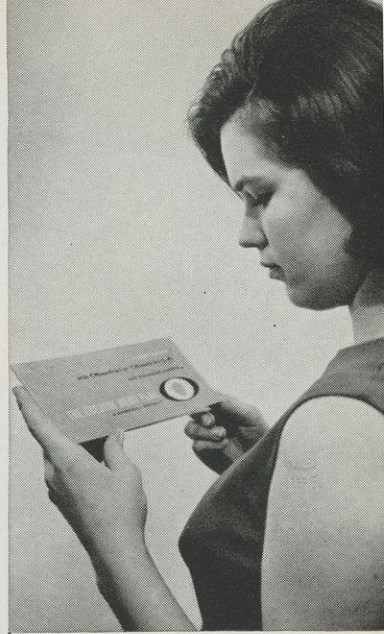
OBEDRIN MENU PLAN