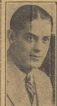
Reprint From The Milwaukee Journal