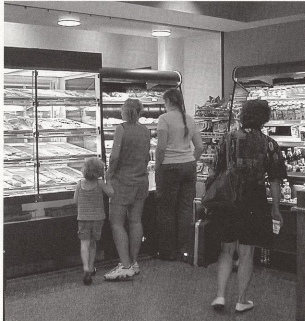
The improved deli at Memorial Union, now known as The Daily Scoop.

The Memorial Union Stiftskeller bar will also be replaced over winter break. The new bar will be in the same location, but it will be more efficient to give you faster service.