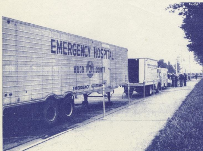
Imposing lineup of Wood county emergency equipment was on exhibit in front of courthouse for viewing by conference representatives.