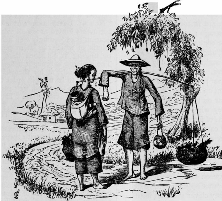
CHINESE MAN AND WOMAN

that God's works are even more wonderful than we always believed them to be? As for the theory being impossible, who are we that we should limit the power of God? If it be said that natural selection is too simple a cause to pro-