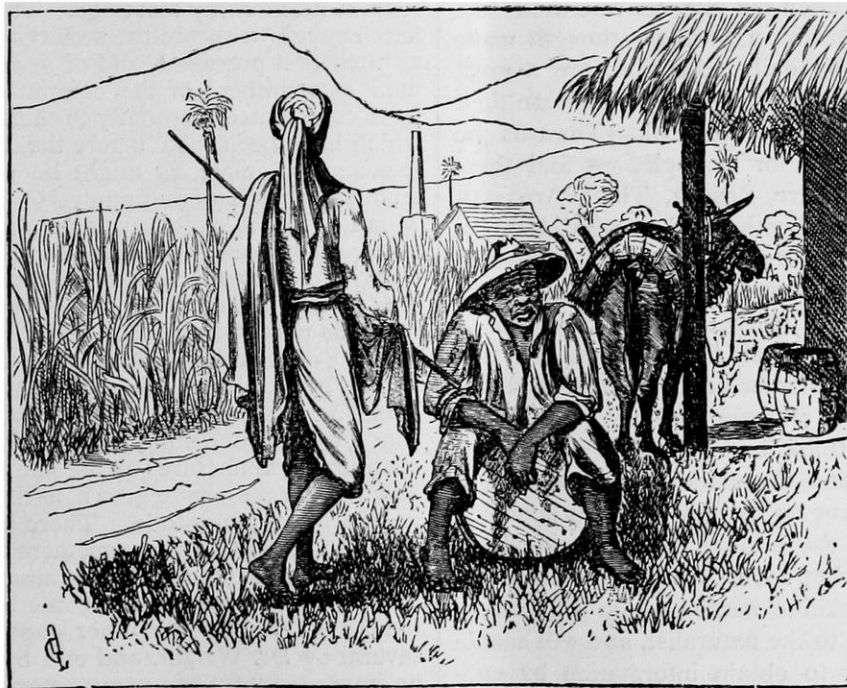
COOLIE AND NEGRO

must have made every traveller in the tropics think what scenes of surpassing beauty might be created by judicious clearing and planting, by helping Nature in a country and climate where, even unassisted, she can do so much, and where such a profusion of beautiful materials exists to