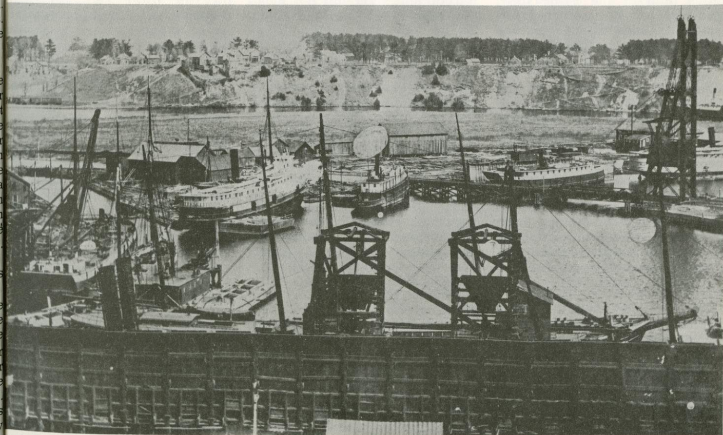
Manitowoc in about the 1900's, shown is the shipyards of Burger Boat Shipbuilding Company.

Shipbuilding was Manitowoc's earliest industry. At first, boats were made of wood. Later, they were made of steel. Polish workers found jobs at the boatyards.